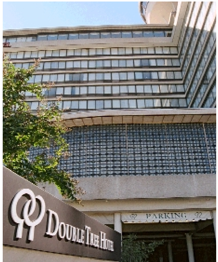
Innovative carpet design is one of the hallmarks of the renovation at this Doubletree hotel, near Reagan National Airport in our nation's capital.

“We strongly encouraged the double-glue method with the bonded cushion. Given the quality and application, this carpet screamed to be installed properly over cushion. Attached cushion is not an option for wool carpets and the heavy weight would be another factor. The double-glue approach with the bonded cushion was really the only way to do it right.”