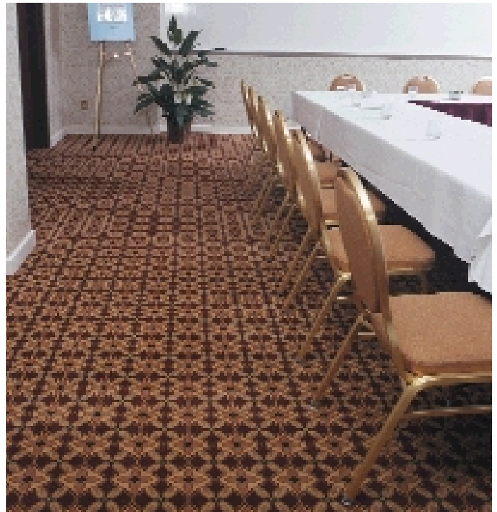
Detail of patterned carpet used in conference room.

longer carpet lifespan, and a host of attractive "green" attributes including the potential of sustainability credits within green building programs are among other benefits offered by installing recyclable polyurethane carpet cushion under workplace carpet.