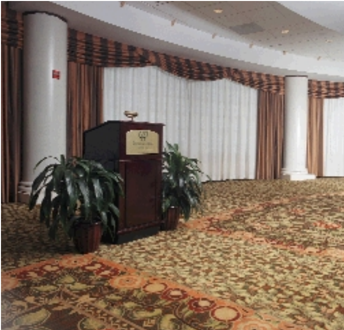
The sweeping curves of the Capital Ballroom at the Doubletree add to the room's charm.